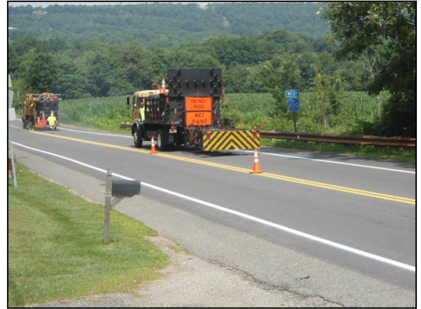
Typical Striping Operation