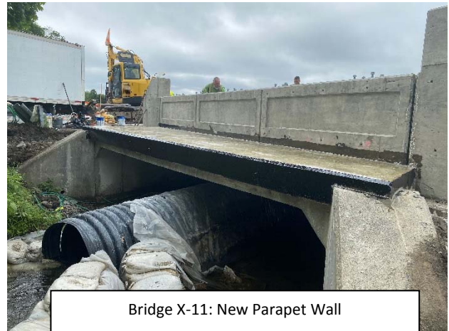
Bridge X-11: New Parapet Wall