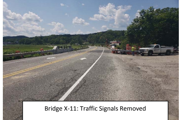
Bridge X-11: Traffic Signals Removed

Final paving and guiderail installation are currently anticipated to begin the first or second week of August, with the exact scheduled dates still to be determined.