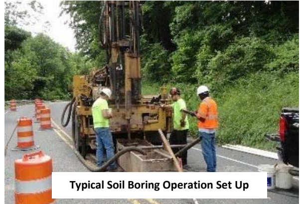
Typical Soil Boring Operation Set Up