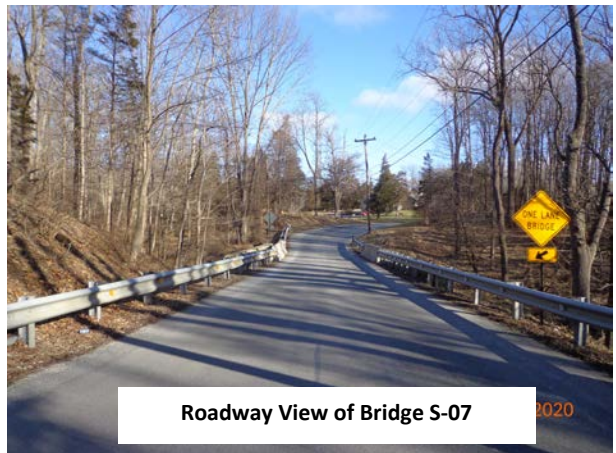
Roadway View of Bridge S-07