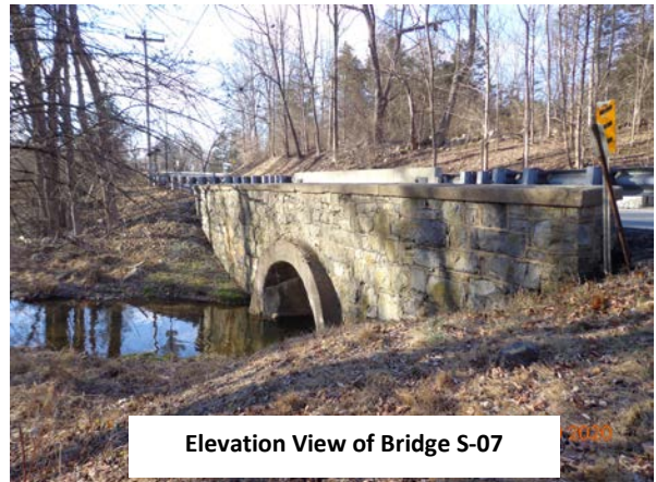
Elevation View of Bridge S-07