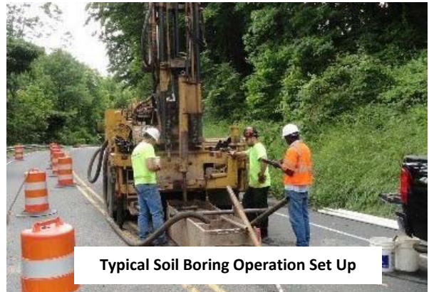
Typical Soil Boring Operation Set Up