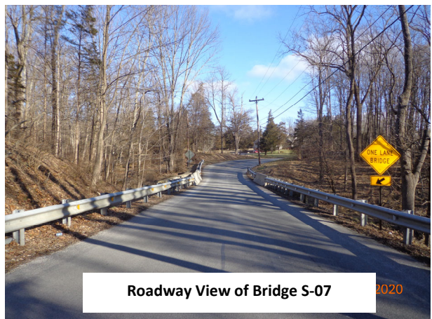
Roadway View of Bridge S-07