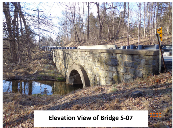
Elevation View of Bridge S-07