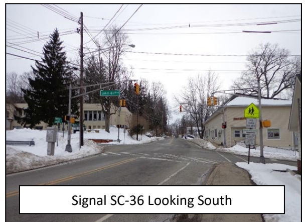
Signal SC-36 Looking South