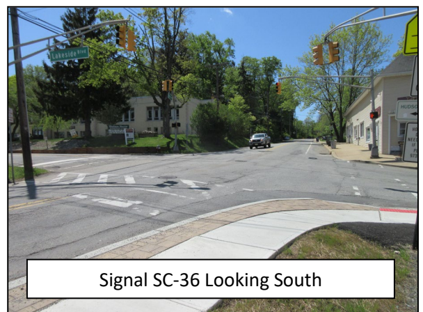
Signal SC-36 Looking South