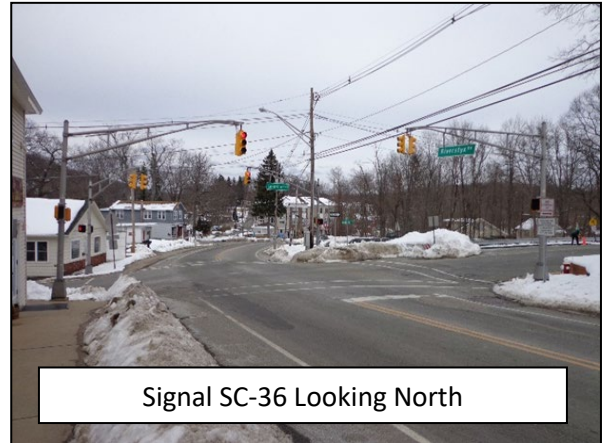
Signal SC-36 Looking North

For more information about this project please feel free to contact Abanoub Ayoub, Civil Engineer Trainee at the Sussex County Division of Engineering at 973-579-0430 or emails can be sent to dpw@sussex.nj.us