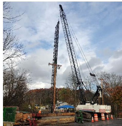
Crane leads erected for pile driving