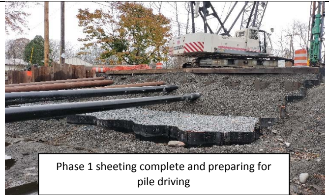
Phase 1 sheeting complete and preparing for pile driving