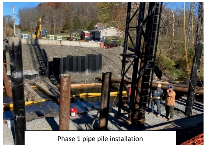
Phase 1 pipe pile installation