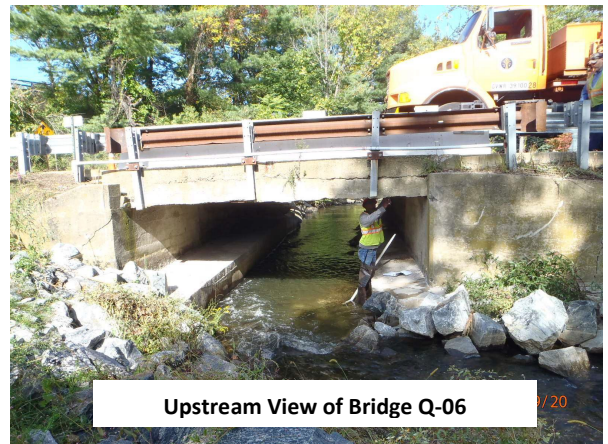
Upstream View of Bridge Q-06