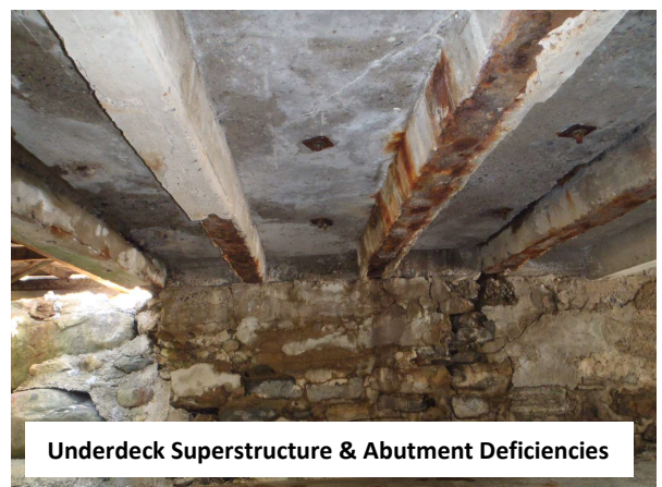
Underdeck Superstructure & Abutment Deficiencies