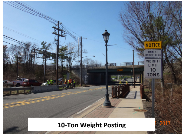
10-Ton Weight Posting