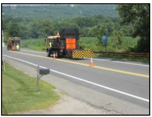
Typical Striping Operation