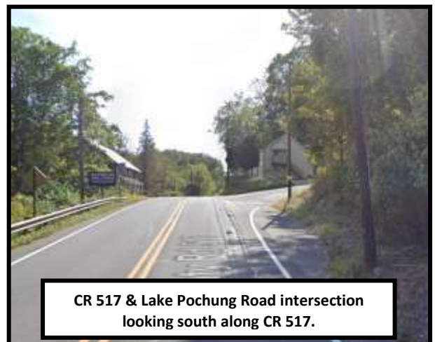
CR 517 & Lake Pochung Road intersection looking south along CR 517.