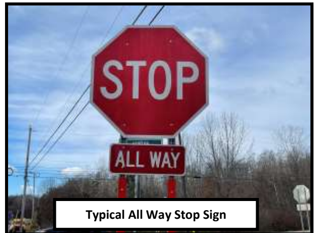
Typical All Way Stop Sign

For more information about this project, please contact the Sussex County Division of Engineering at: 973-579-0430 or dpw@sussex.nj.us