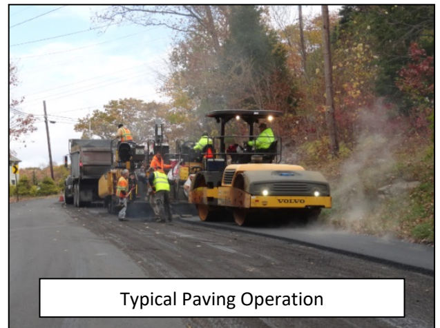
Typical Paving Operation