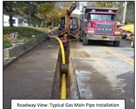
Roadway View: Typical Gas Main Pipe Installation