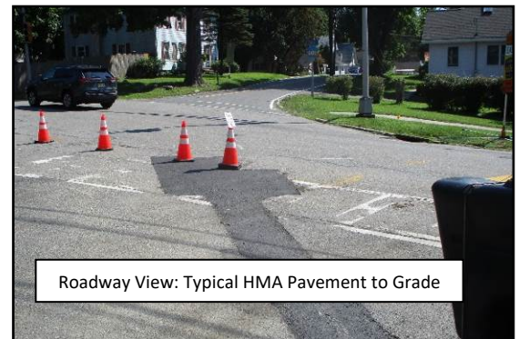
Roadway View: Typical HMA Pavement to Grade