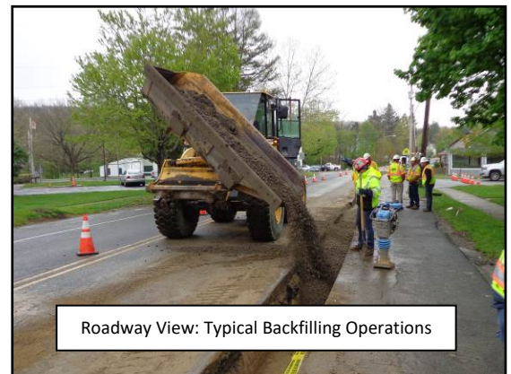
Roadway View: Typical Backfilling Operations