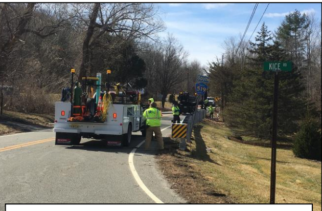
Typical Guide Rail Installation