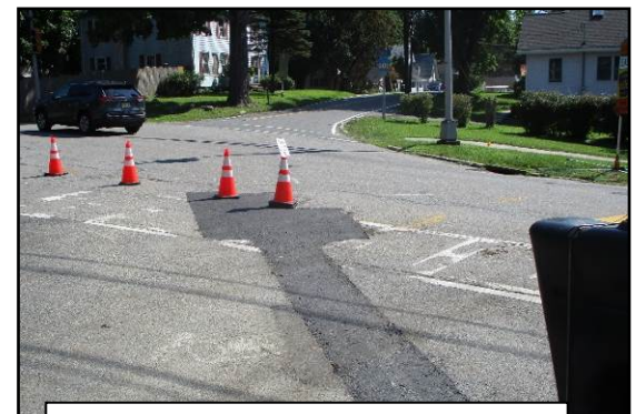
Roadway View: Typical HMA Pavement to Grade