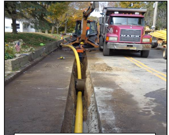
Roadway View: Typical Gas Main Pipe Installation