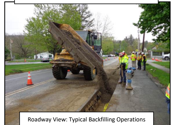
Roadway View: Typical Backfilling Operations