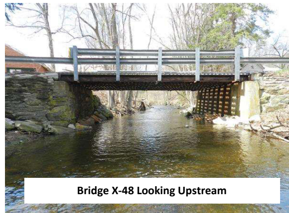
Bridge X-48 Looking Upstream