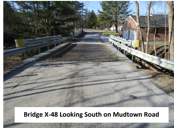
Bridge X-48 Looking South on Mudtown Road

A road closure and signed detour will be in place for the duration of construction, which is anticipated to last through the end of 2025. Access to driveways will be maintained throughout construction.