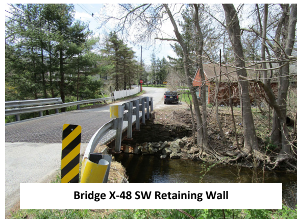
Bridge X-48 SW Retaining Wall